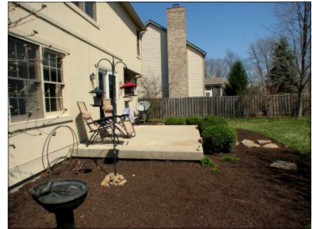
Cement patio & stone steps