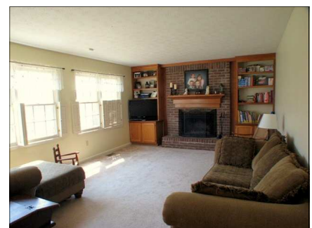
Family w/fireplace & built-in shelves