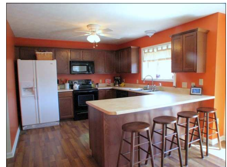
Great updated kitchen!