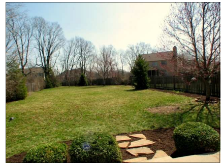
Fabulous 0.37acre fenced yard!