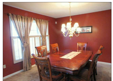
Formal dining room